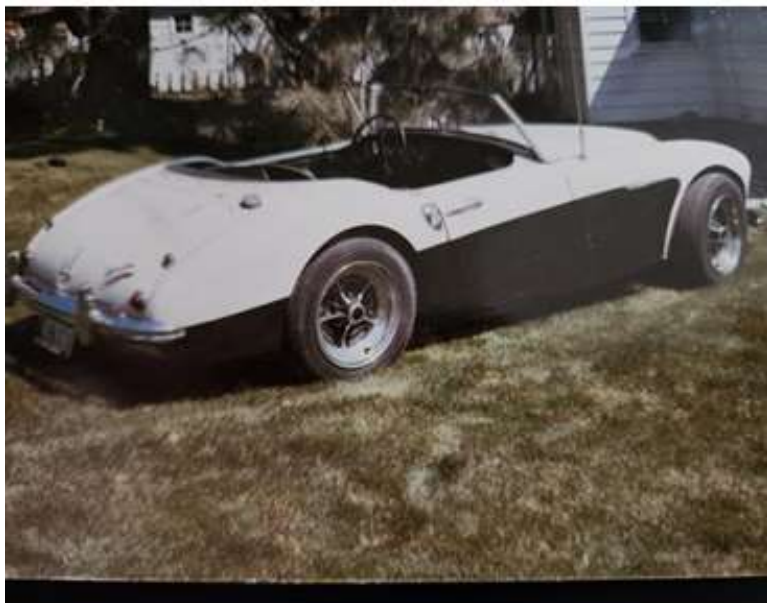
Old 1985 photo just after I purchased it