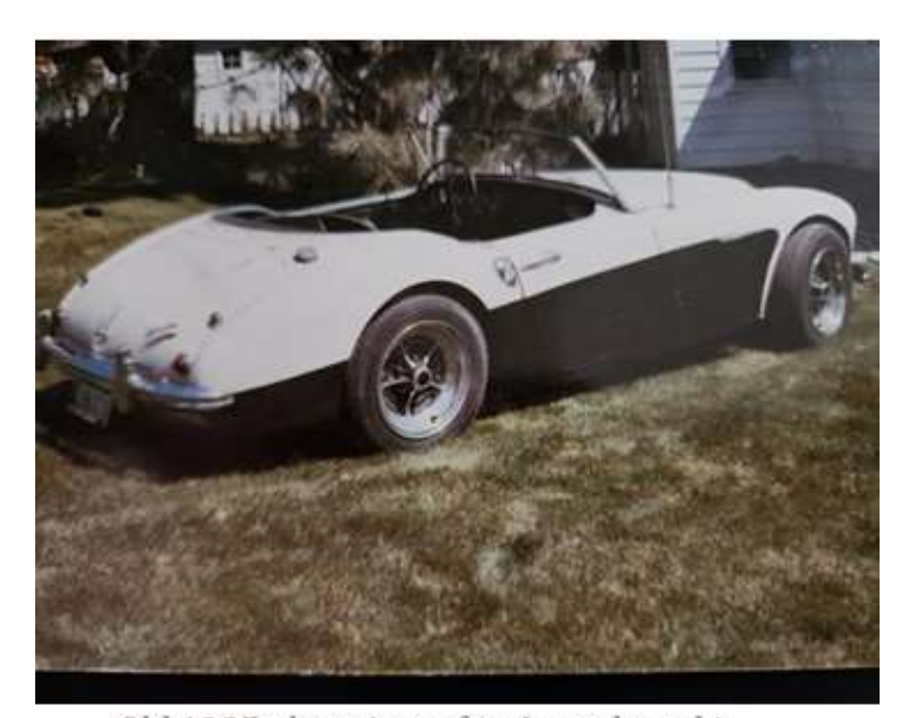
Old 1985 photo just after I purchased it